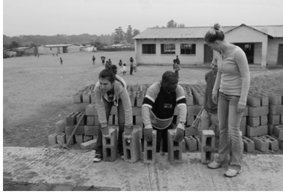
Moving Bricks Closer to the Foundations

Our aim is to help build a school so that children in this town can get an education. Not going to school affects the whole of their lives. And it affects the whole world too.